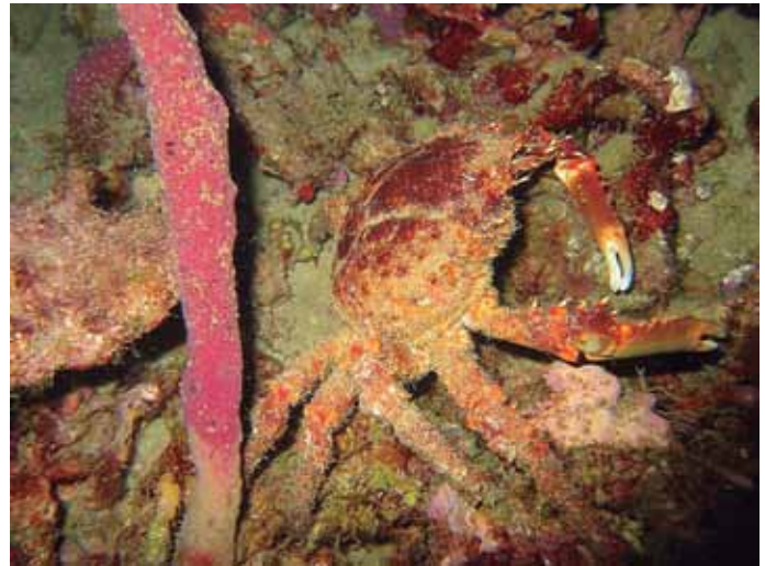
Mithrax spinosissimus - Cangrejo Rey