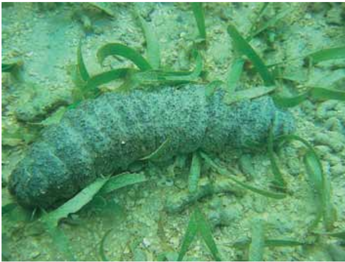
Holothuria mexicana - Pepino de Mar