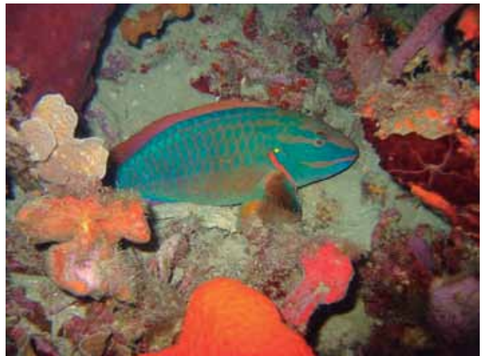
Sparisoma viridae - Pez Loro