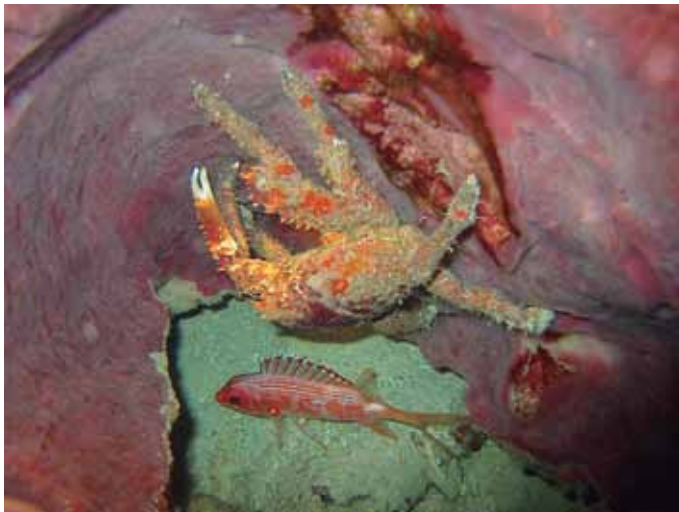
Holocentrus rufus - Diablito