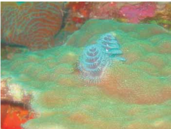
Spirobranchus giganteus - Gusano y Porites colonensis - Coral