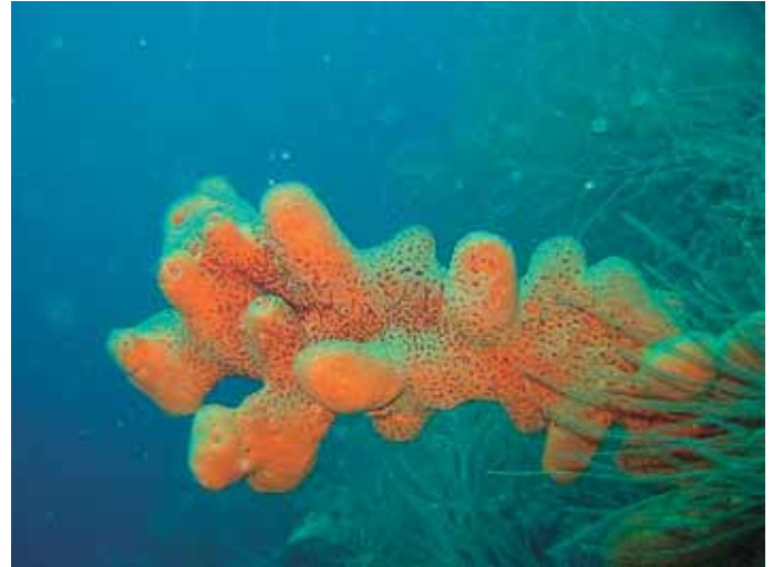
Agelas sventres - Esponja Naranja Perforada