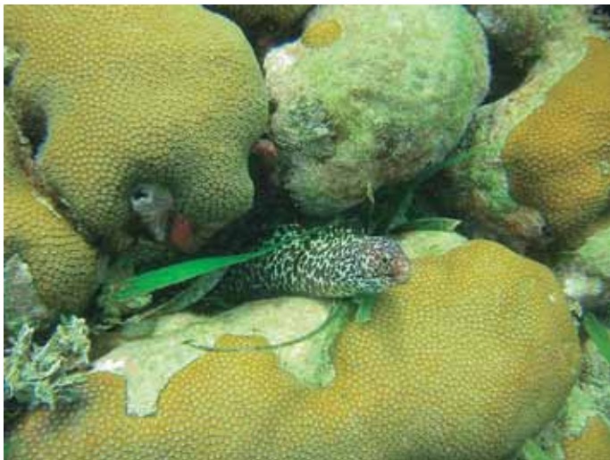
Porites astreoides - Coral y Gymnothorax moringa - Morena